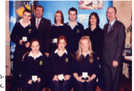
Bronze Gaisce Award Winners