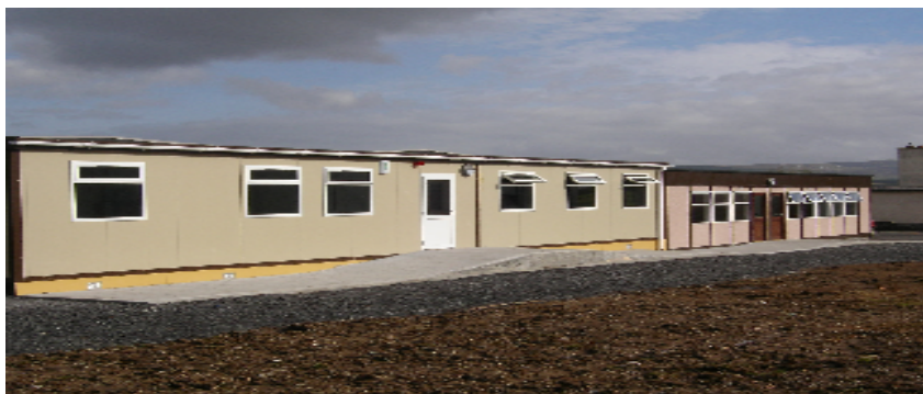
A view Of Our New Classrooms at Coola